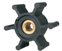
Impeller (3.1") 80 mm

Type High quality seamless design that is thermally protected Leads Wire leads Temperature Limits 140°F (60°C) Max. Duty Cycle Intermittent Voltage 12v/24v